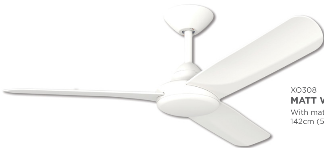
XO308 MATT WHITE With matt white polymer blades 142cm (56")