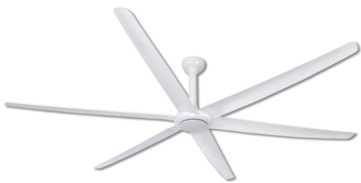
TBF1061 MATT WHITE With matt white blades 270cm (106")