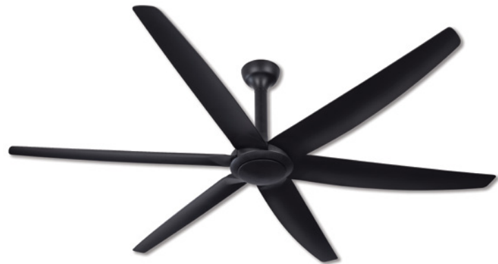
TBF1062 MATT BLACK With matt black blades 270cm (106")