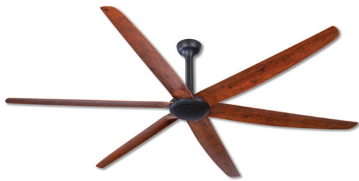
TBF1064 MATT BLACK WITH NATURAL OAK With Natural Oak finished blades 270cm (106")