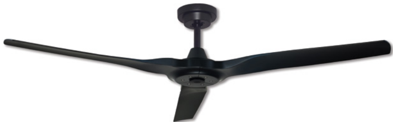
R322 MATT BLACK With matt black polymer blades 152cm (60")