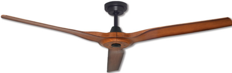
R325 MATT BLACK With Koa polymer blades 152cm (60")