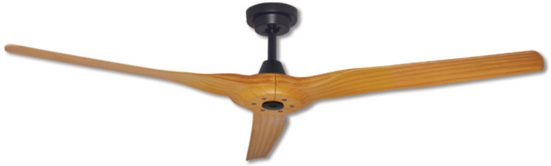
R324 MATT BLACK With Bamboo polymer blades 152cm (60")