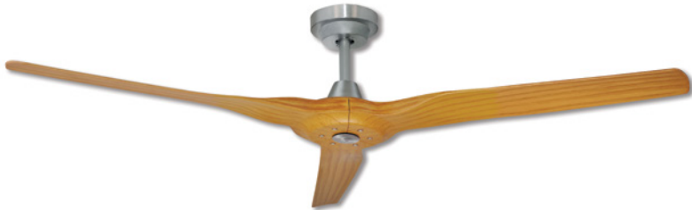
R323 BRUSHED ALUMINIUM With Bamboo polymer blades 152cm (60")