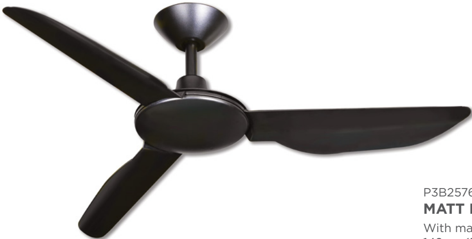
P3B2576 MATT BLACK With matt black polymer blades 142cm (56")