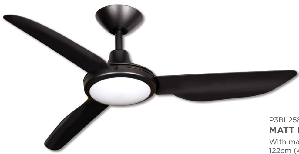
P3BL2582 MATT BLACK With matt black polymer blades 122cm (48")