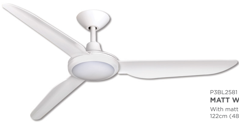
P3BL2581 MATT WHITE With matt white polymer blades 122cm (48")