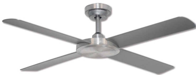
P2202 BRUSHED ALUMINIUM

With matt black polymer blades 132cm (52")