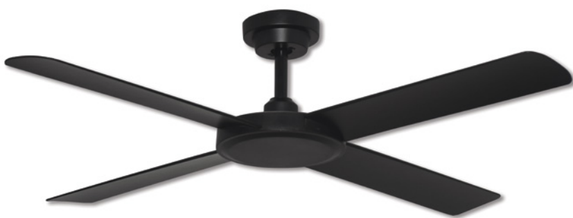
P2201 MATT BLACK

With matt black polymer blades 132cm (52")