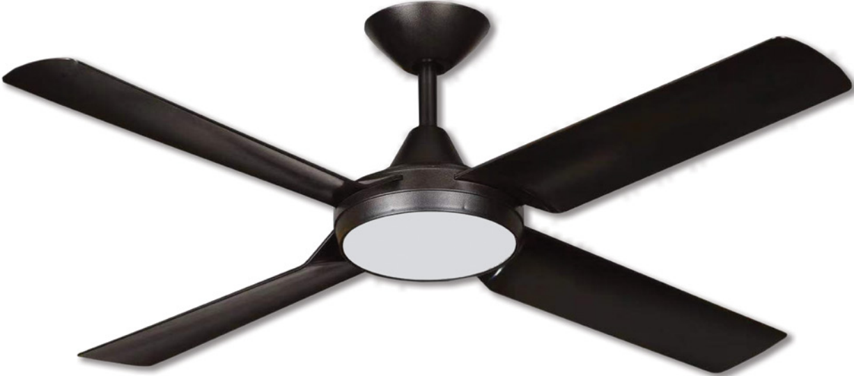
NIL106 MATT BLACK With matt black polymer blades 132cm (52")