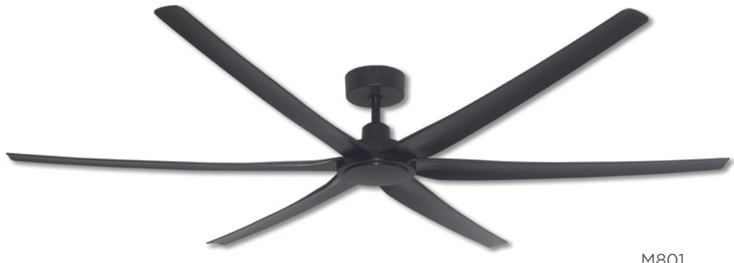
M801 MATT BLACK With matt black polymer blades 203cm (80")