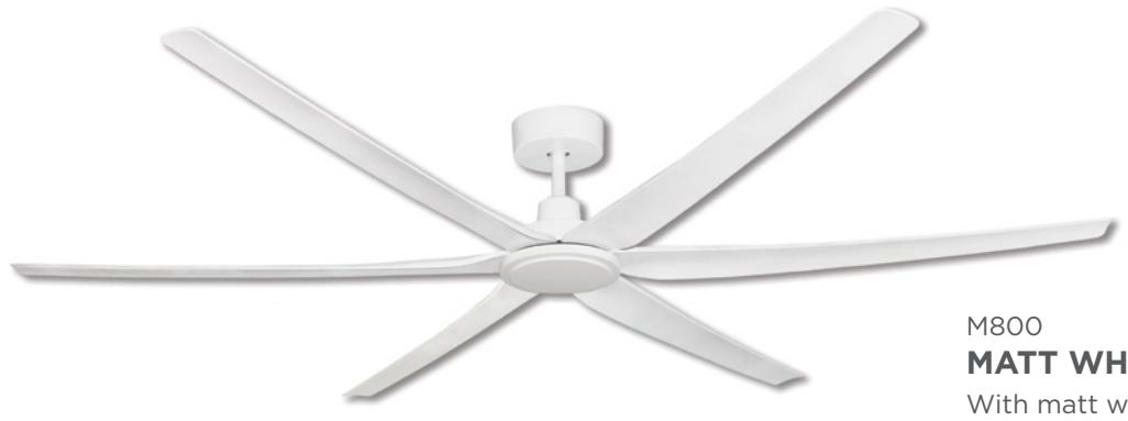
M800 MATT WHITE With matt white polymer blades 203cm (80")