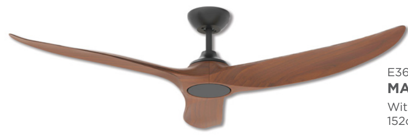
E368 MATT BLACK WITH KOA

With matt black polymer blades 152cm (60")