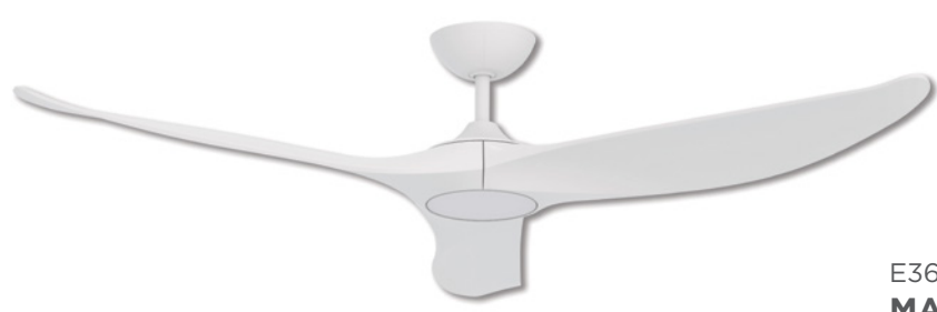
E366 MATT WHITE

With matt white polymer blades 152cm (60")