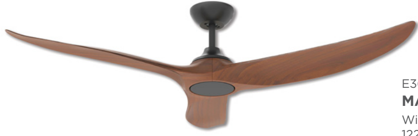
E362 MATT BLACK WITH KOA

With matt black polymer blades 122cm (48")