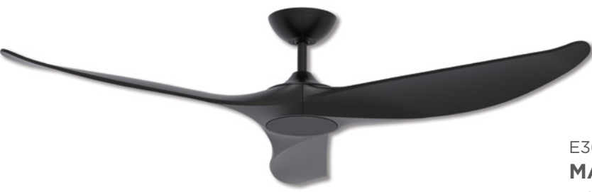
E361 MATT BLACK

With matt white polymer blades 122cm (48")