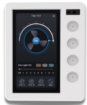
Pixie Touch Panel Part#:STP54BTAS**