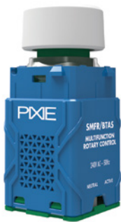
PIXIE Multifunction Rotary Control** #SMFR/BTAS