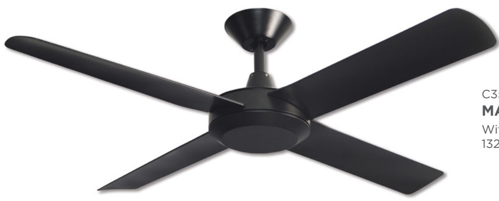
C351 MATT BLACK With matt black blades 132cm (52")