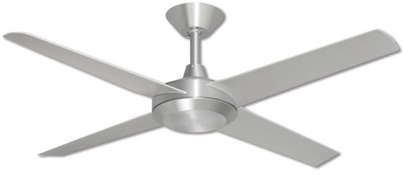
C502 BRUSHED ALUMINIUM With silver blades 132cm (52")