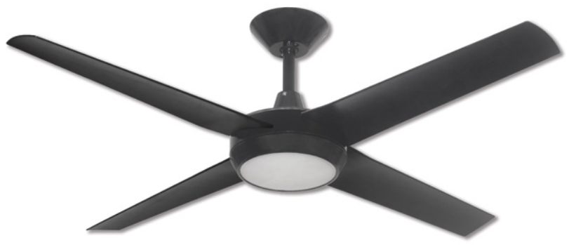
CL507 MATT BLACK With matt black blades 132cm (52")