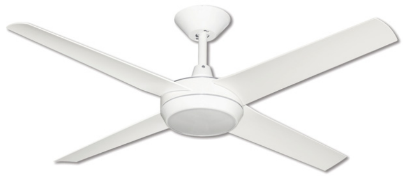
CL506 MATT WHITE With matt white blades 132cm (52")