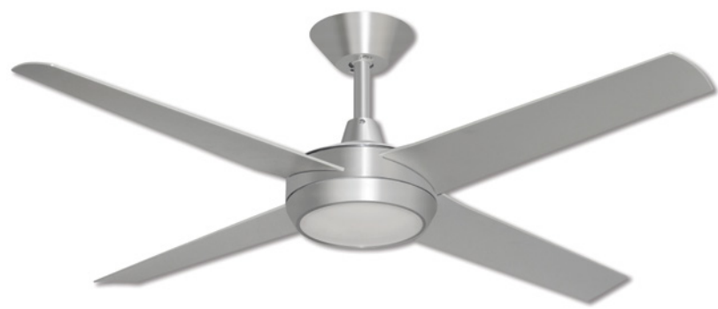
CL508 BRUSHED ALUMINIUM With silver blades 132cm (52")